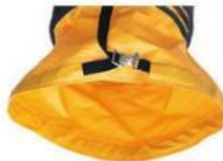
Belt with fast connecter