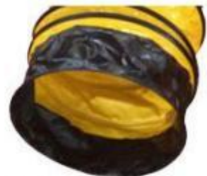
Other cuff design