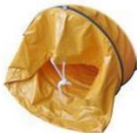
Bugle end with rope